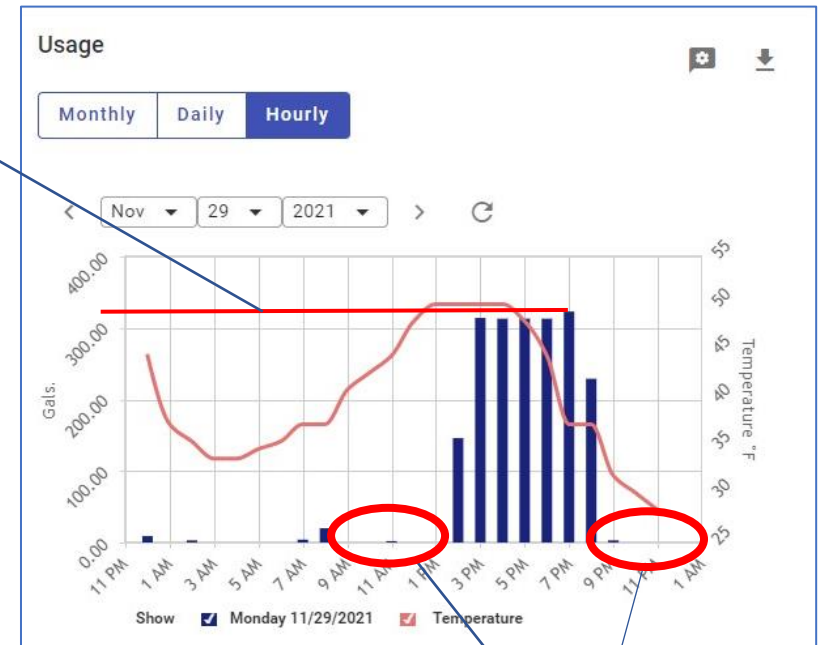
Figure 2: High Usage, No Leak