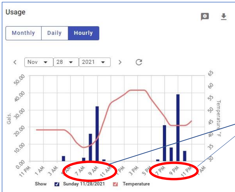
Figure 3: Normal Usage, No Leak